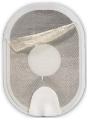
Figure 1: Separated gel that has folded onto itself when peeled.

It is also possible that the gel could separate almost completely from the foam/tin backing when peeled, (see Figure 3 .) Due to a small amount of gel surface contact area with the skin, electrical arcing could occur when a shock is delivered leading to burns to the patient's skin, or the AED could be unable to deliver any shock through the pads. A delay in therapy will result while the user installs a replacement pads cartridge (if available) or performs CPR while waiting for Emergency Medical Services Personnel to arrive. For comparison, Figure 4 shows a normal pad. No matter the state of the pad, follow the voice prompts because the AED will step you through the necessary actions.