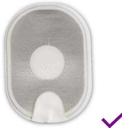
Figure 4: Normal pad.

Action: Apply pads to the patient according to the Instructions for Use/Owner's Manual.