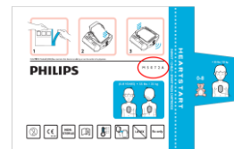
M5072A foil packaging