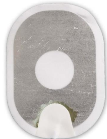
Figure 3: Gel almost completely separated from backing.

Action: Apply pads to the patient. Do not hesitate.