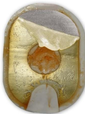
Figure 2: Separated, folded gel may also have a discolored and/or melted appearance.

Action: Apply pads to the patient. Do not hesitate.